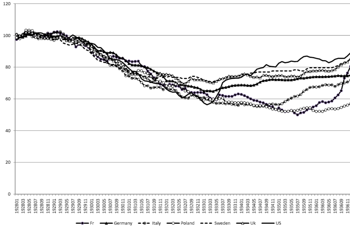
Figure 3: Wholesale Prices in Various Countries, 1928-1936 (1928=100)