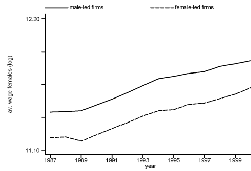
panel B, females' wages