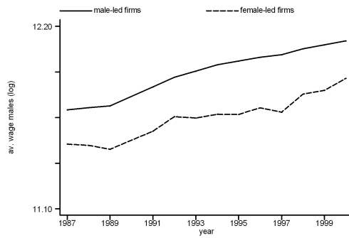
panel A, males' wages