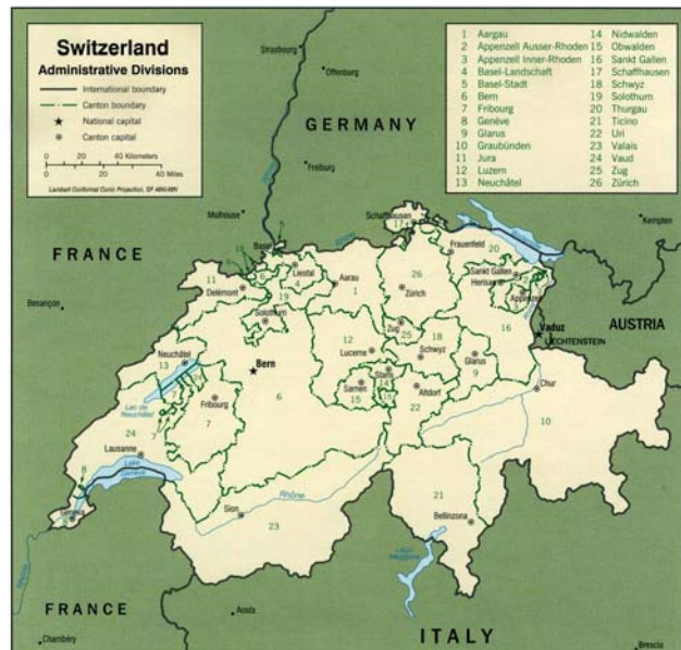
Figure 2.1: The cantonal borders of Switzerland

Note: http://www.kyte.de/mygeo/karten/switzerland/landkarte_schweiz.jpg .