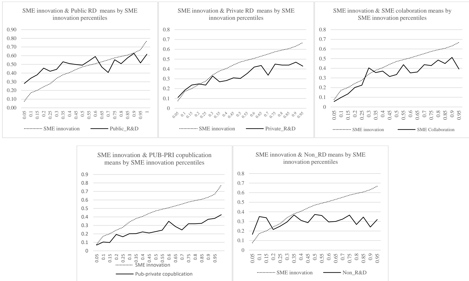
Figure 1. Mean variation of variables across regional SME innovation quartiles