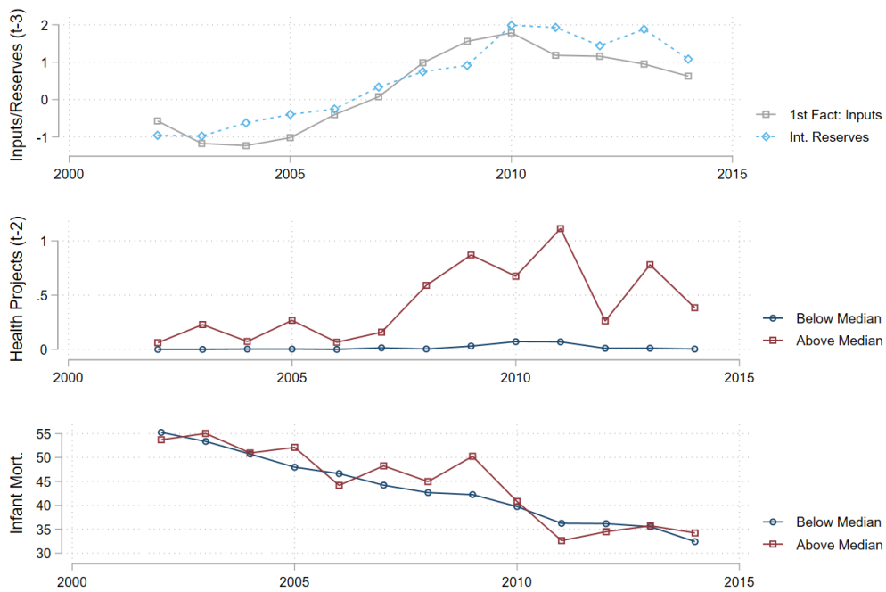
Figure 1 – Testing Spurious Trends: China

Notes: The first panel shows the first principal factor of China’s (logged and detrended) production of aluminum (in 10,000 tons), cement (in 10,000 tons), glass (in 10,000 weight cases), iron (in 10,000 tons), steel (in 10,000 tons), and timber (in 10,000 cubic meters) over time. It also shows the (detrended) change in net foreign exchange reserves (in trillions of constant 2010 US dollars). The second panel shows the average number of Chinese health projects within the group that is below the median of the probability of receiving projects and the group that is above the median (conditional on receiving any project). The lower panel shows the infant mortality rate within these two groups.