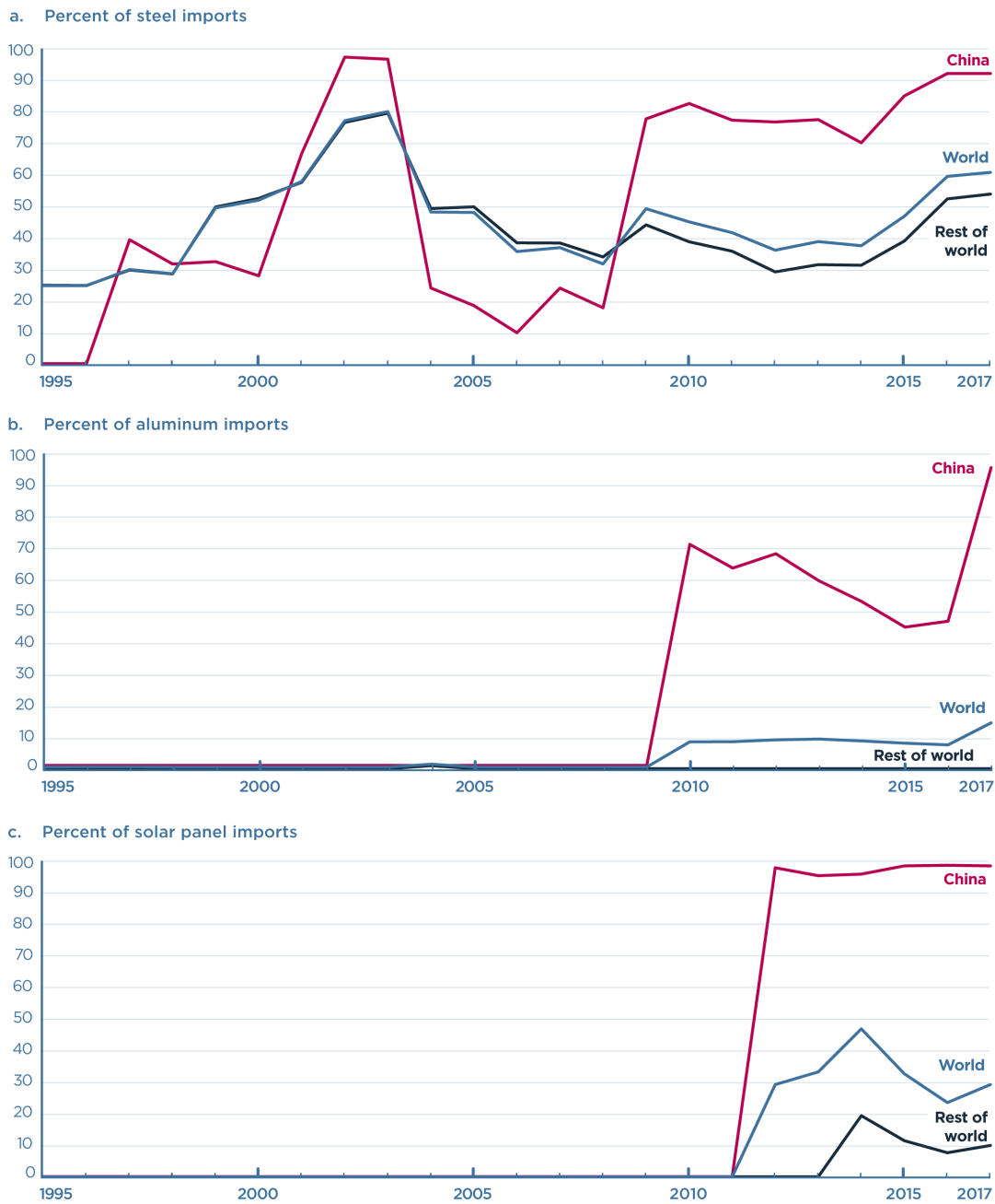
Figure 1. US steel, aluminum and solar panel imports covered by antidumping, countervailing duties and safeguards, 1995–2017

Note: Share of US import of steel (panel a), aluminum (panel b), and solar panels (panel c) covered by antidumping, countervailing duties, or safeguards in effect each year.